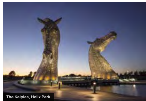
The Kelpies, Helix Park

I loved Glasgow. The best thing about my experience was getting to travel, and the Scottish people. I highly recommend it! @UofGvisiting