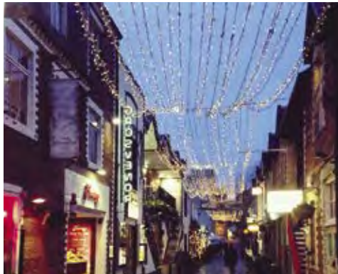
Saturday Night's alright in Ashton Lane