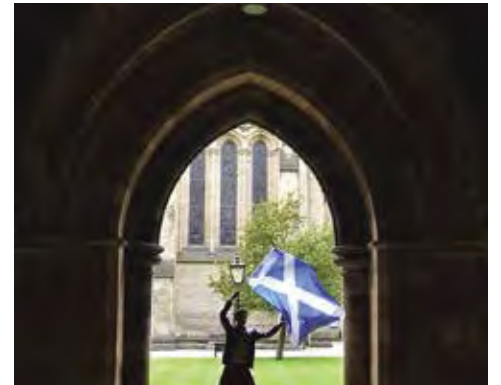
Flying the flag