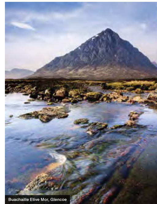
Buachaille Etive Mor, Glencoe