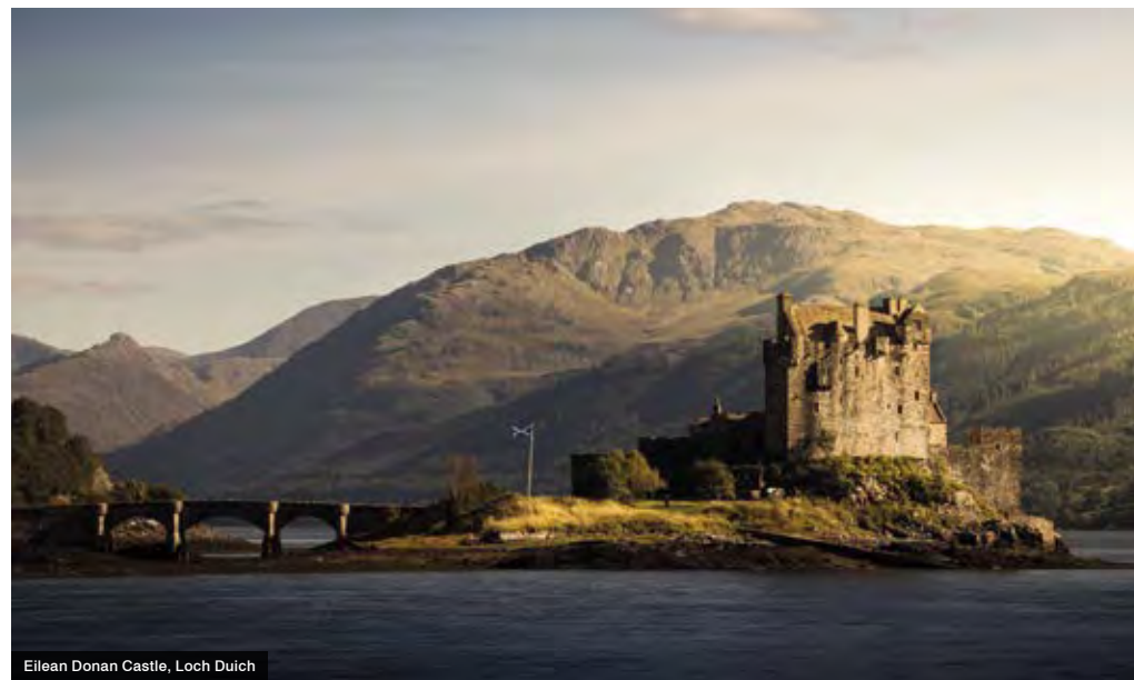
Eilean Donan Castle, Loch Duich