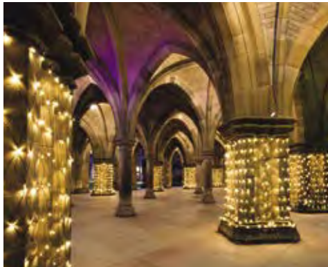
Oh so twinkly cloisters