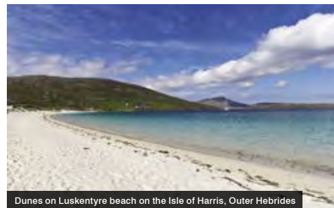
Dunes on Luskentyre beach on the Isle of Harris, Outer Hebrides