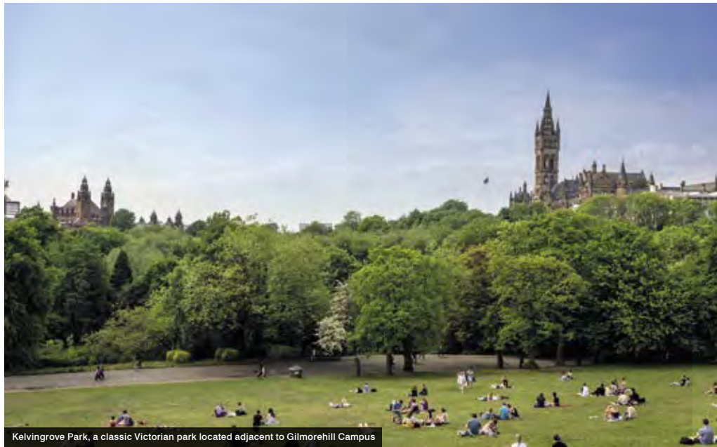
Kelvingrove Park, a classic Victorian park located adjacent to Gilmorehill Campus