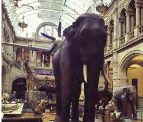
Night at the Museum