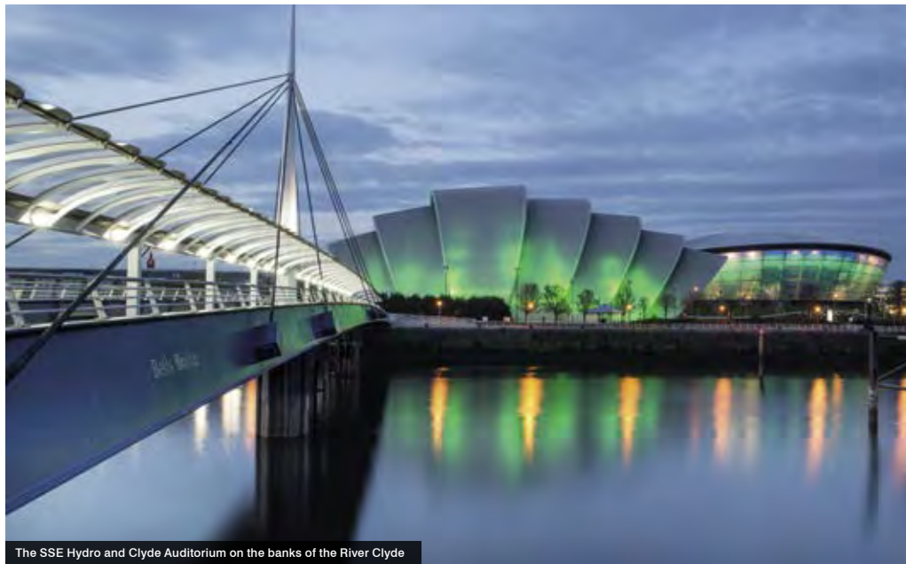
The SSE Hydro and Clyde Auditorium on the banks of the River Clyde